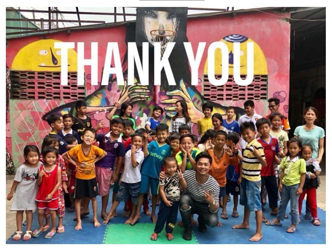
UM VERTEILEN (www.umverteilen.de)