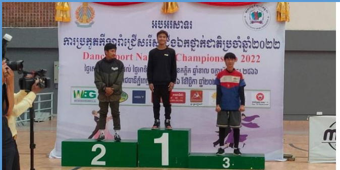
32 nd Southeast Asian Games.

After competing and winning many national Breakdancing competitions this year, former and current Tiny Toones students have earned the opportunity to compete for a Gold medal for Cambodia in this year's